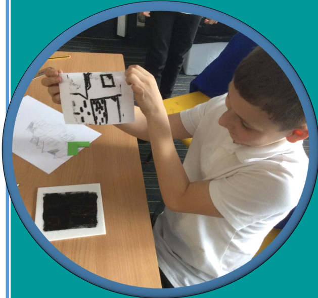
Dolphins enjoyed an afternoon of printing