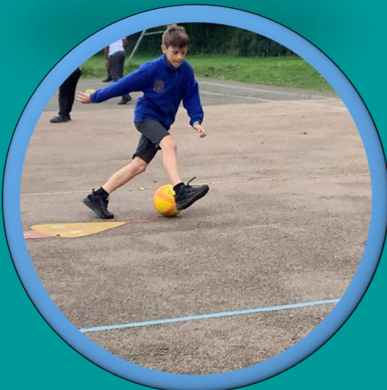
Football is just one of the sports available at after school club