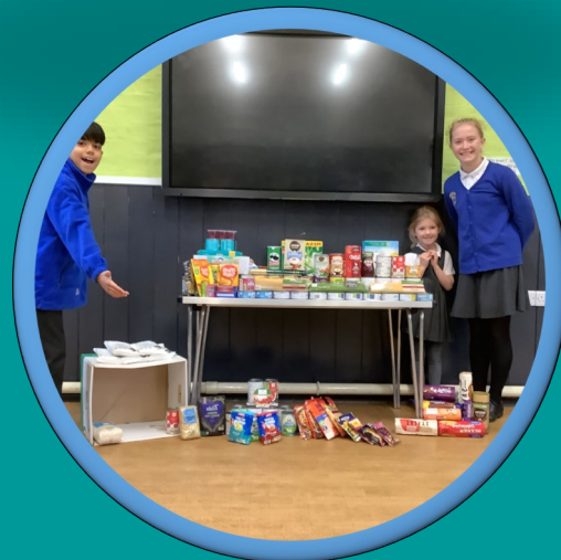
Had a great response to the Food Bank Appeal for the Hope Centre