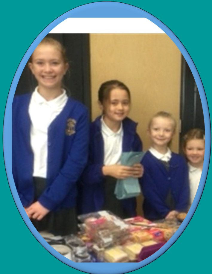
The school councillors ran a successful Coffee Morning for Macmillan that raised £135.36.