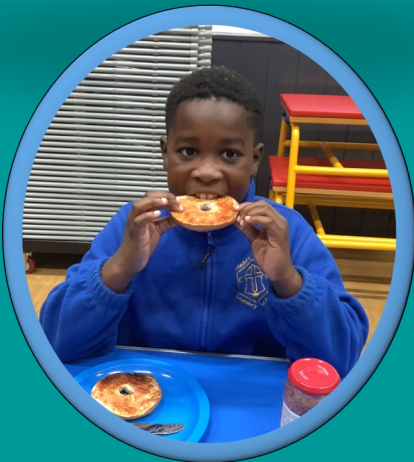
Breakfast Club - Enjoying a bagel to start the day.