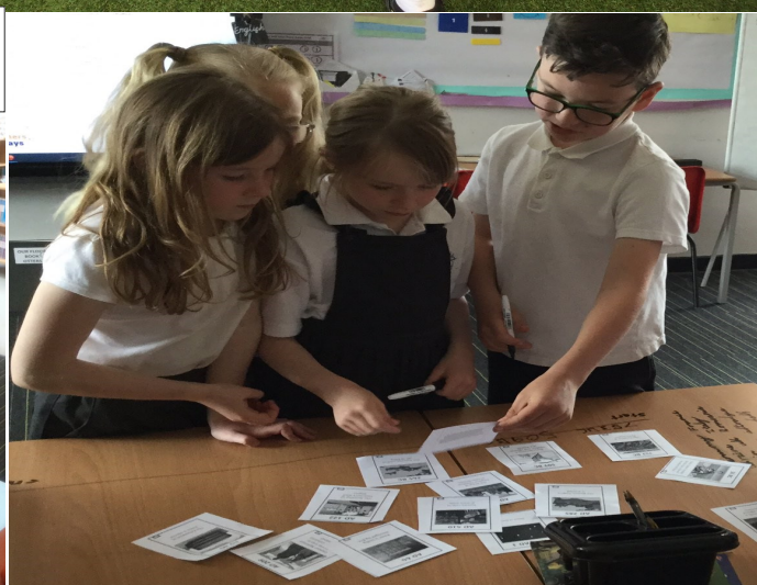
Otters have been working hard to find out about the rise of the Roman Empire in order to create a chronological narrative.