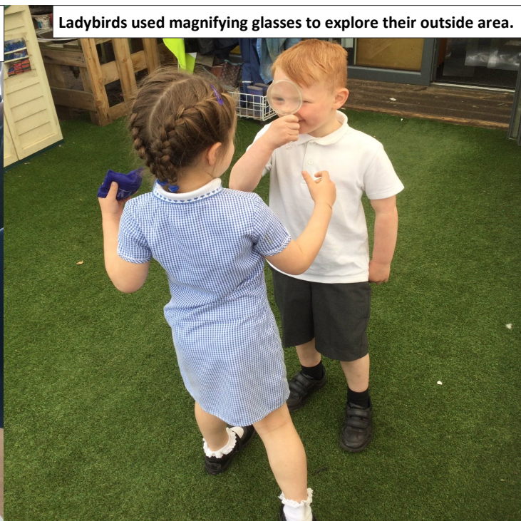
Ladybirds used magnifying glasses to explore their outside area.

(Below) Hedgehogs created some healthy salad wraps in class and learnt about being hygienic and safe whilst chopping their salad up.